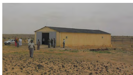
(a) Reference Ammunition depot built in Aleg and Akjoujt