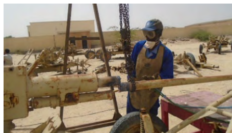
(b) Anti aircraft gun