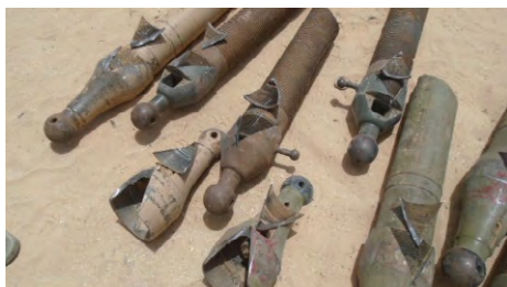
(a) Mortar systems

This first phase supported the MNA in the destruction of 82 decommissioned military ordnance and engineer vehicles, including mortar systems, light howitzers, anti-aircraft, radar vehicles and tanks. The decommissioned weapon systems have been demilitarized and dismantled in Nouakchott (70 items) and Nouadhibou (12 items).