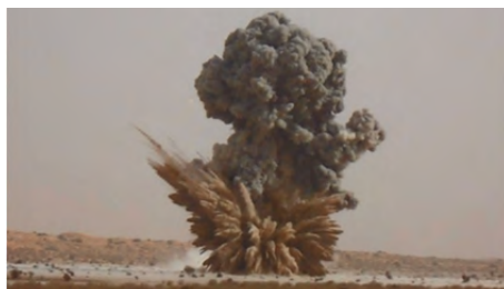
(b) Open Detonation of MANPADS and CA