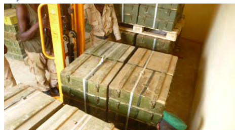
(b) Ammunition training