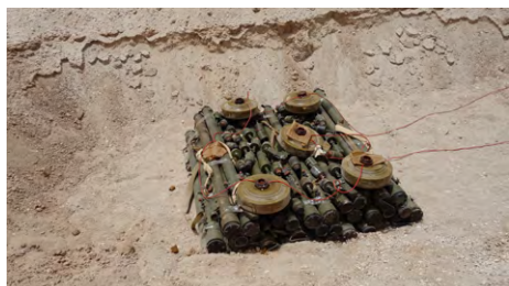
(a) MANPADS destruction

The first phase of this Trust Fund contributed to the destruction of 1,322 tonnes gross weight of obsolete and unserviceable conventional ammunition (CA) and 159 MANPADS by means of Open Burning and Open Detonation (OB/OD). The consumables were delivered during the first Mauritania Trust Fund.